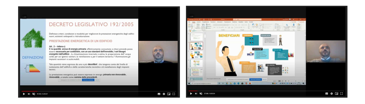
Figure 1. Selection of slides presented during the working groups in the 2nd edition in Veneto

Participants focused not only on the technical advantages, but also economical ones, well-being aspects, communicational strategies.