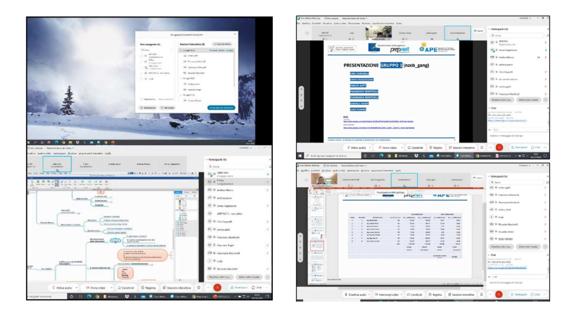
Figure 2. Selection of pictures taken during the working groups in the 2nd edition in Friuli-Venezia Giulia