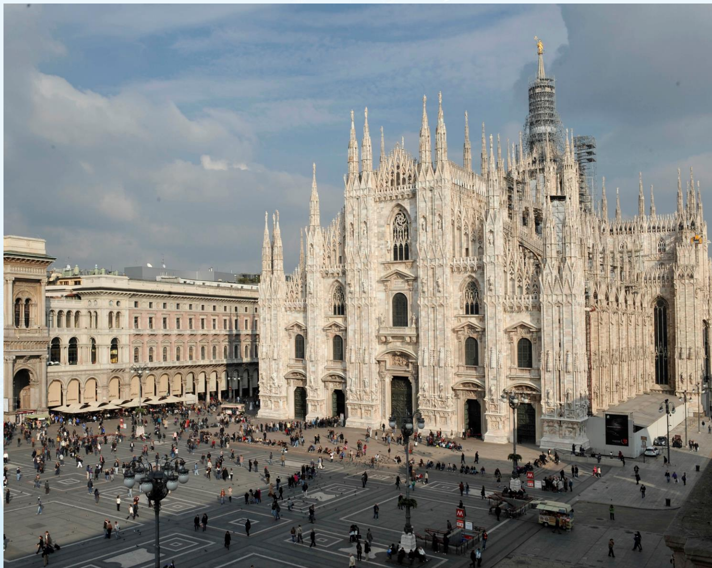
Cathedral of Milan