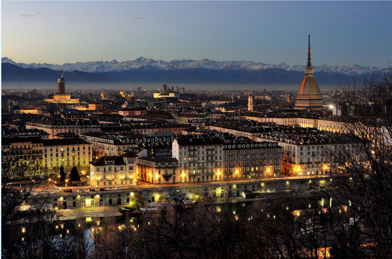
Turin city center