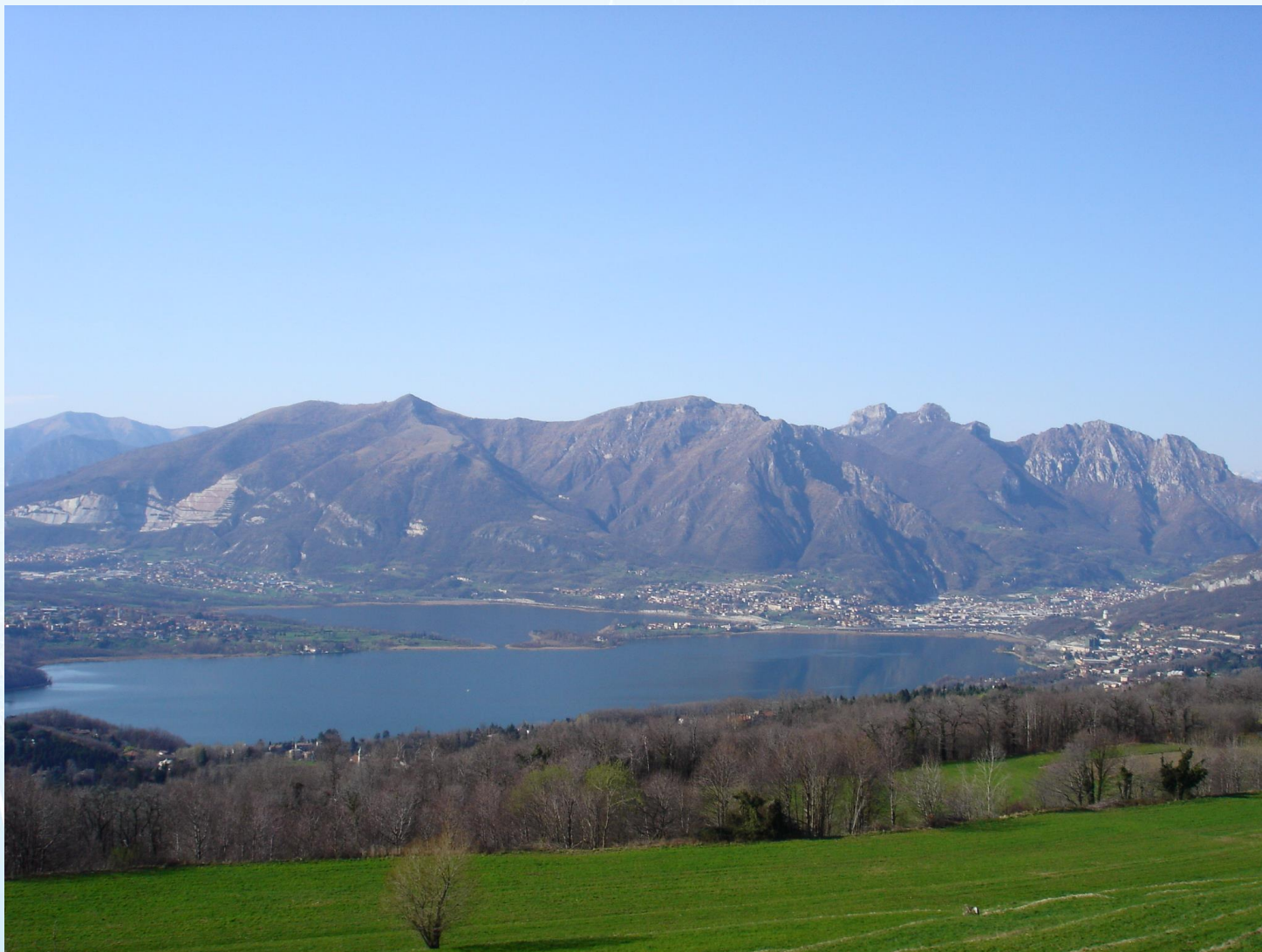
Lago di Annone, Lecco