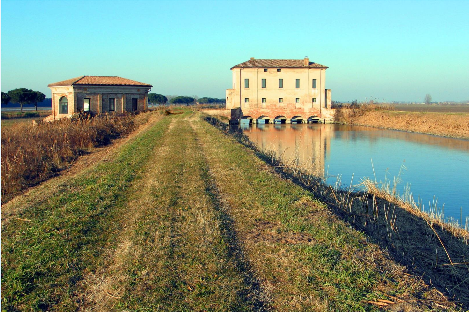
Torre Palù, Goro (Ferrara)