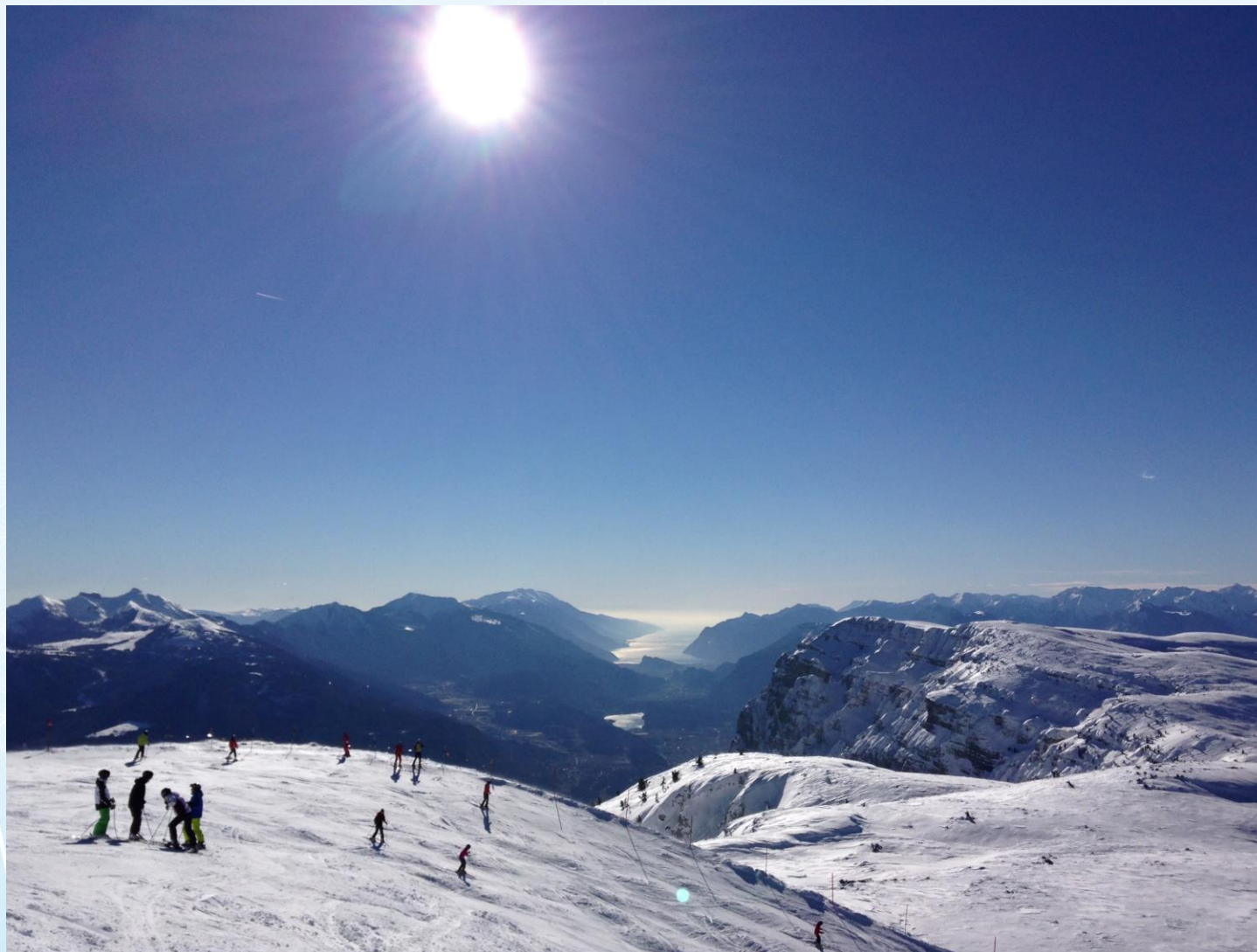
View of the Garda lake from the Paganella