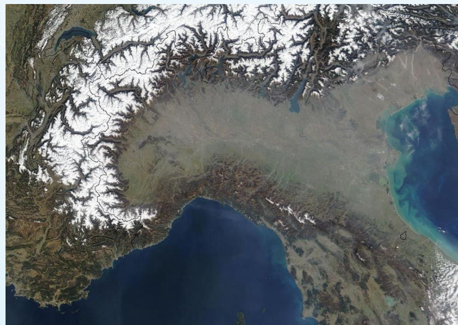
Satellite Image of Northern Italy in the winter season