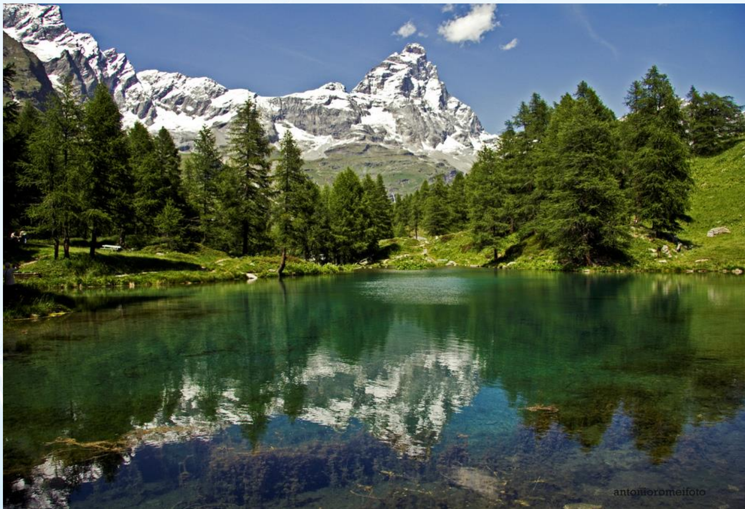
Monte Cervino, Cervinia