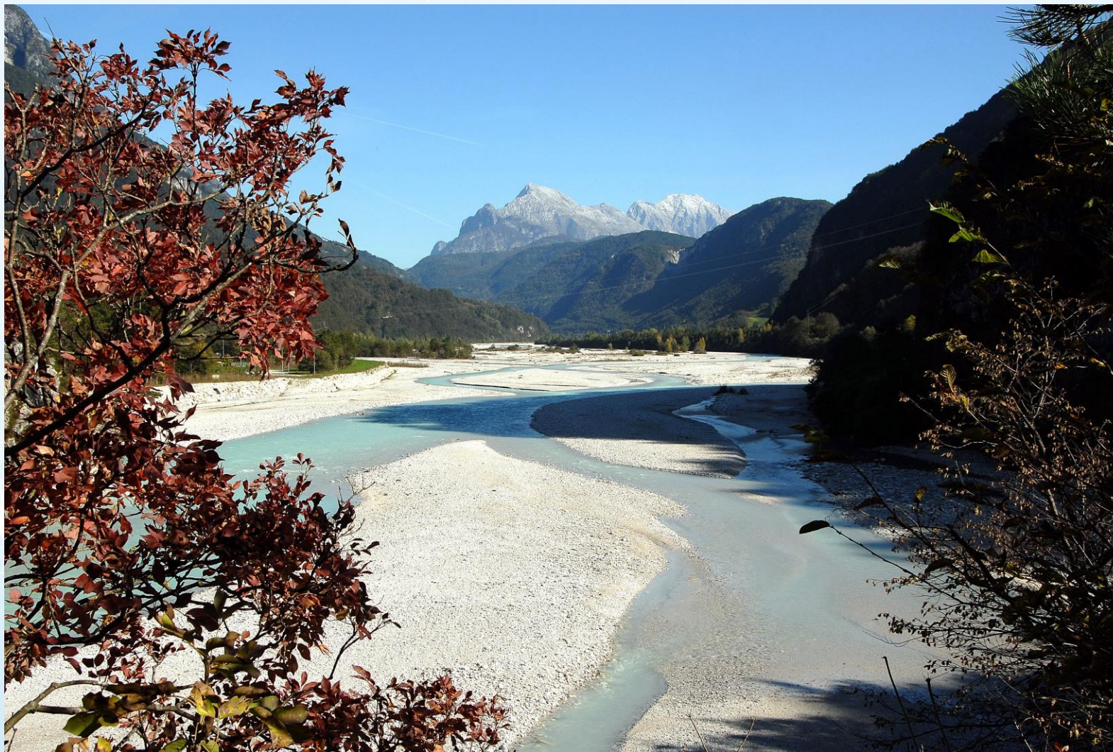
Fella river, Moggio Udinese