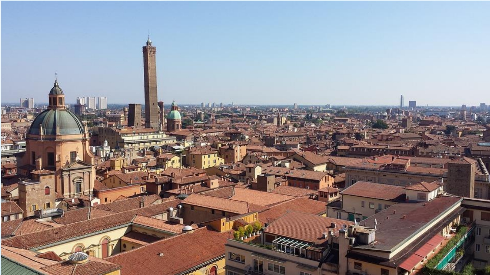
Bologna city center